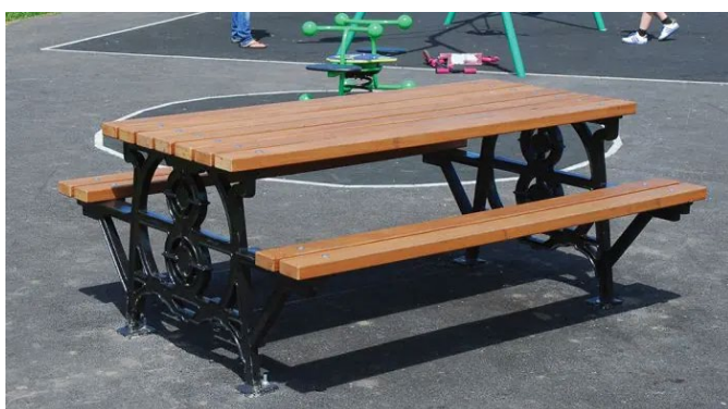
Option 1 – Eastgate Picnic Bench

The below styles are available from suppliers we have utilised in the past.