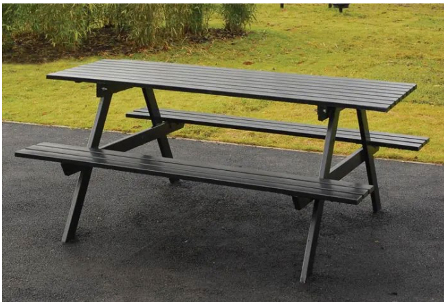
Option 2 - Cannock Chase Picnic Bench

With anti-vandal steel slats - £1,299 ex VAT Delivery estimated cost - £378 Total - £1,677 (with the anti-vandal steel slats)